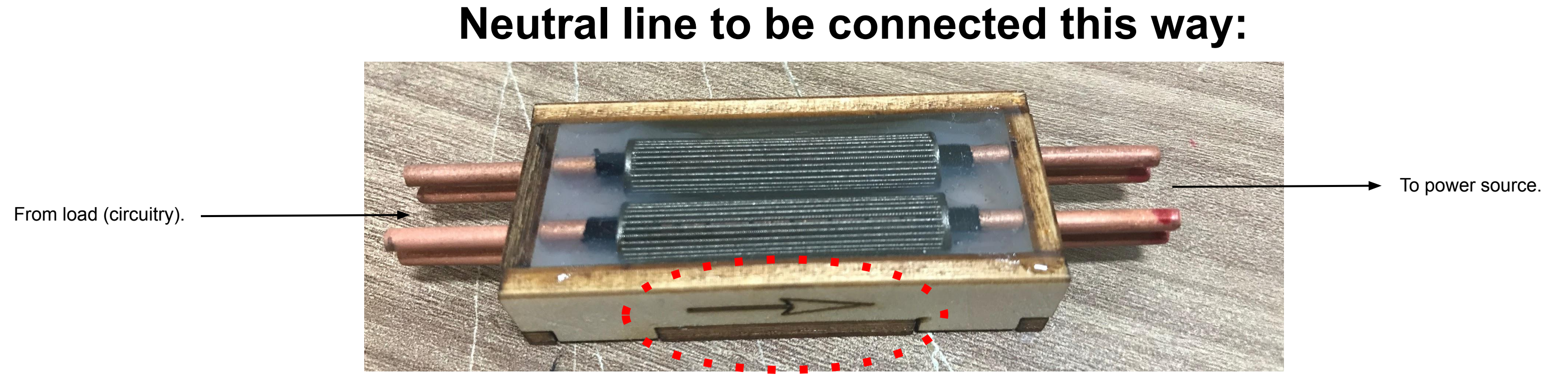
Note direction of arrow!